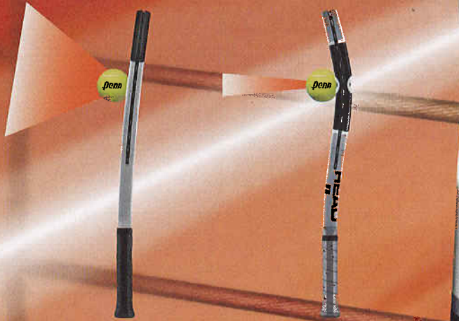
Conventional Racquet: Lack of Control.

Experience a new world of control with no loss of power. Real Technology. Real Benefit.