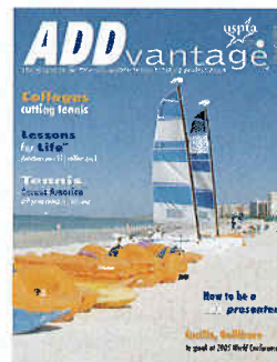
On the cover ... Marco Island, Fla.